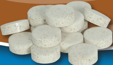
Controlled Release Tablets