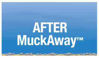
AFTER MuckAway TM