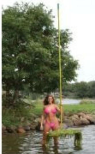
Product # WRK09