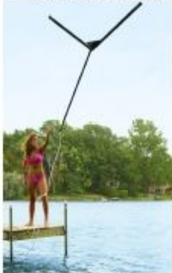
Product # WRZ09